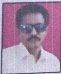
SHRI.MAZHAR ALI KHAN GARU CORPORATE & INTERNATIONAL HIGH SCHOOL